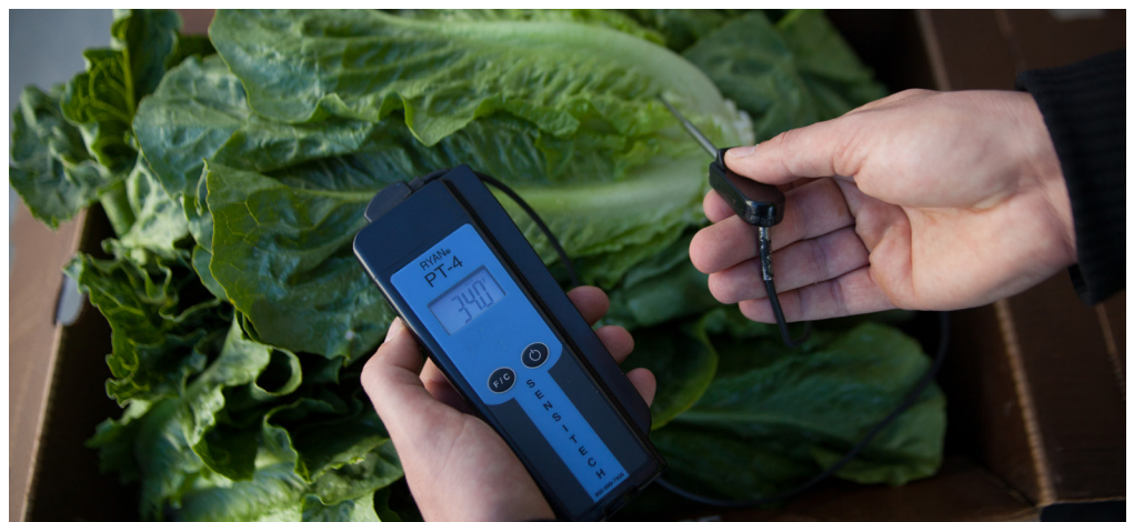
Facility staff monitor product temperature and oversee the cooling process to ensure product safety and integrity as well as energy efficiency.

By consolidating and centrally locating its facilities D'Arrigo Bros. Co., of California significantly reduced the travel distance and time from field to facility. The company prioritized traffic flow and efficiency when designing the new facility. From the moment a load of product arrives employees monitor and manage the product and equipment to ensure quick, efficient cooling.